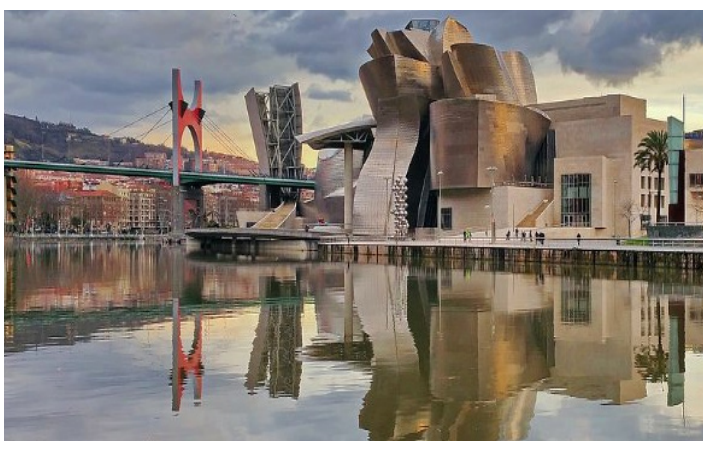
Guggenheim Museum, in Bilbao, capital of Basque Country, where we will begin our trip.