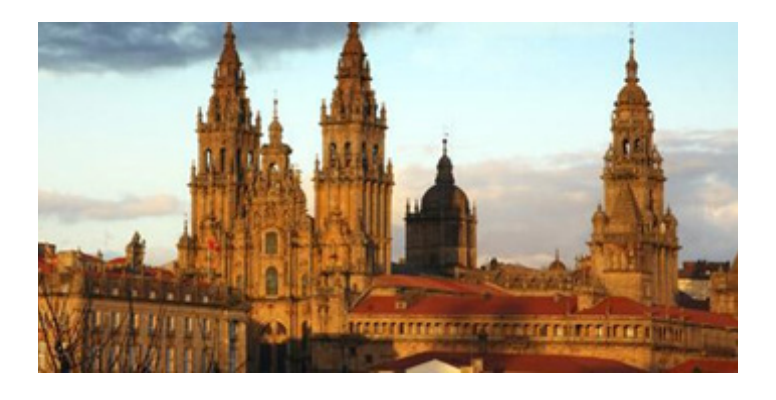
Santiago de Compostela cathedral, where we will finish the trip.