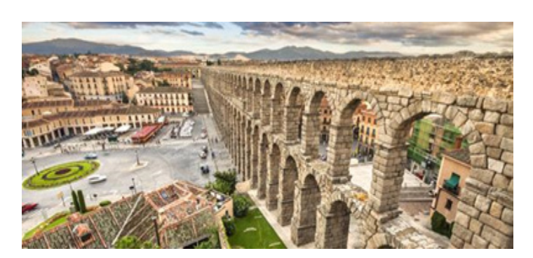
Roman Aqueduct of Segovia, built in the II Century